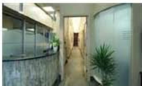
Larger photo & full caption File size: 32.1 KB (585px X 356px) Caption: A move for the better