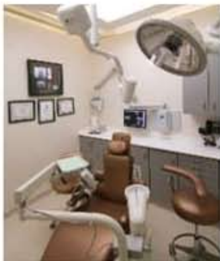
Larger photo & full caption File size: 13 KB (217px X 323px) Caption: office design