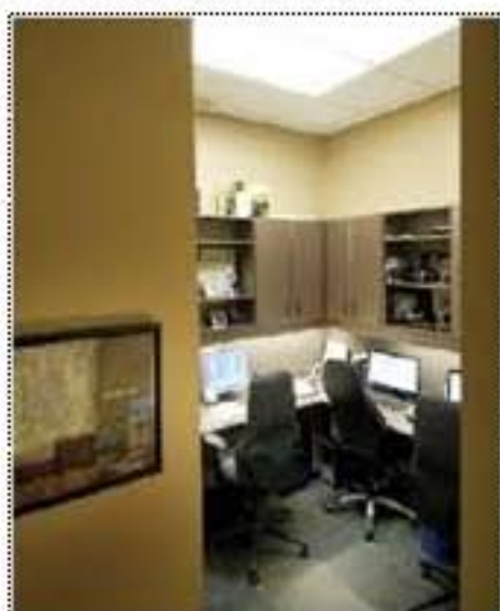
Larger photo & full caption File size: 13.1 KB (244px X 299px) Caption: A move for the better