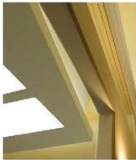
Larger photo & full caption File size: 9.6 KB (235px X 276px) Caption: office design