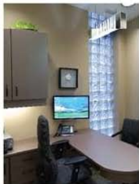
Larger photo & full caption File size: 12.8 KB (216px X 297px) Caption: A move for the better