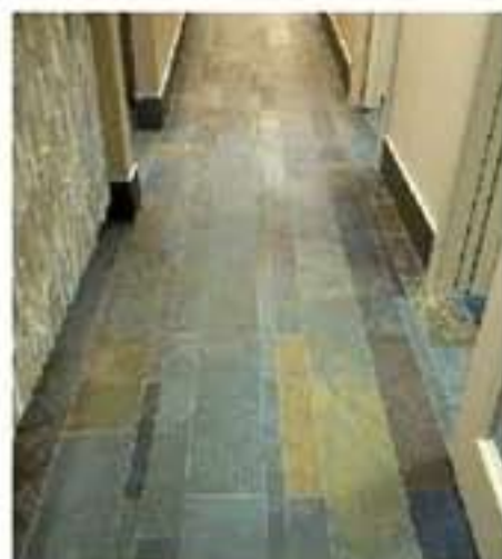
Larger photo & full caption File size: 13.4 KB (235px X 266px) Caption: A move for the better